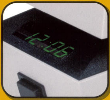
Optional Digital Display

The LT Series Stamps help you keep track of incoming mail, legal documents, freight bills and customer pick-ups, invoices and payments, or any other sensitive document. Without a doubt, a Lathem LT is the fastest, easiest, and most efficient way to keep up with all the "ins and outs" of your business.