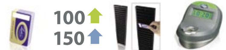
Extra Employee Badges Employee Capacity Expansion Badge Storage Racks TS100 Fingerprint Reader